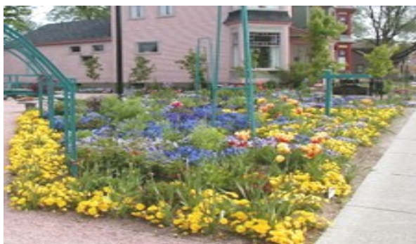
A beautiful splash of color at the Monet Garden in early summer.