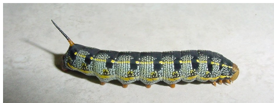
White-lined sphinx caterpillar.