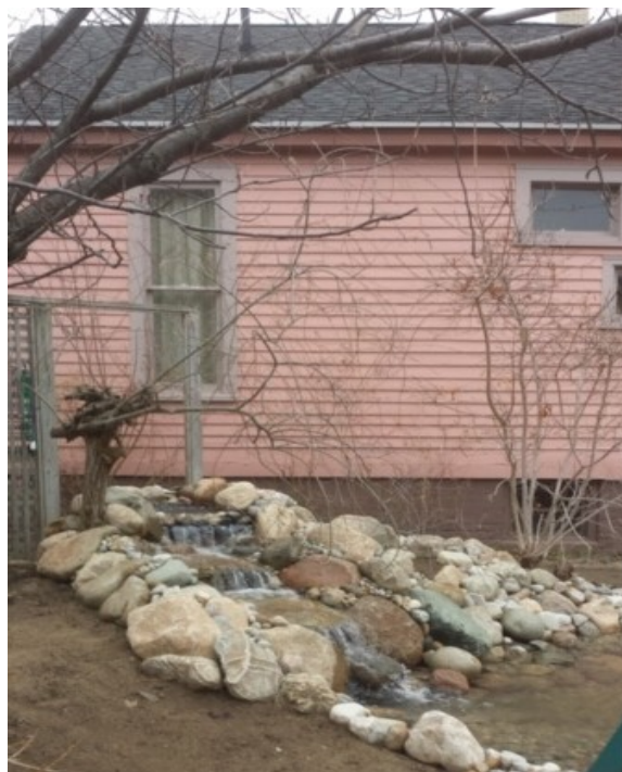
Newly designed Monet waterfall and pond.